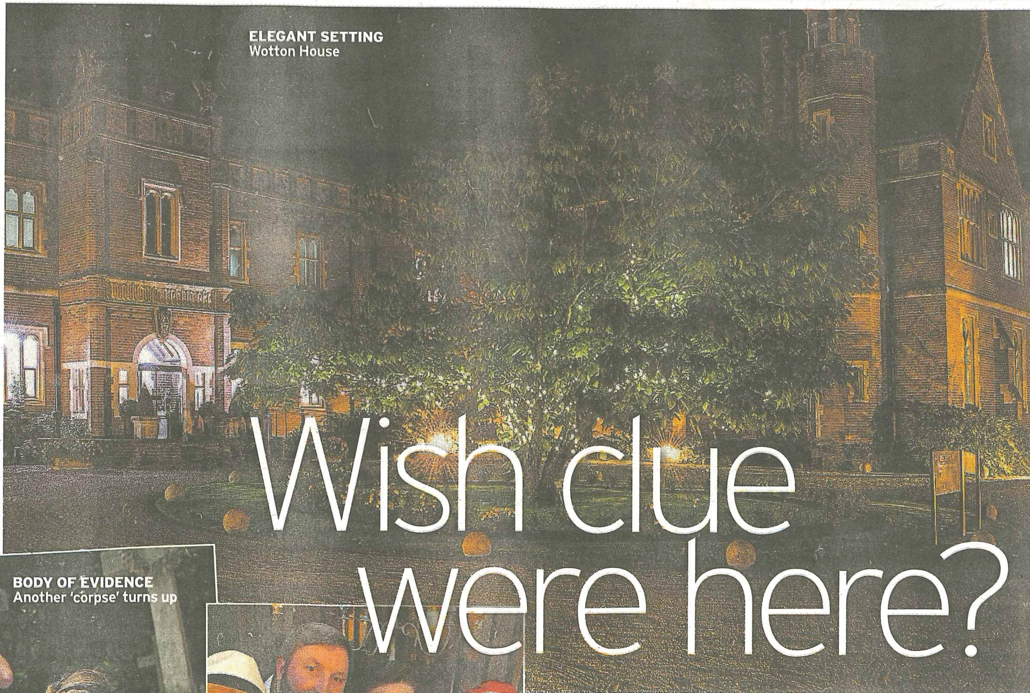
ELEGANT SETTING Wotton House