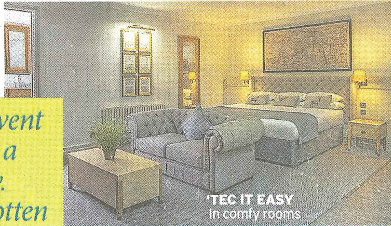
TEC IT EASY In comfy rooms

A two-night B&B break starts at £300pp including two three-course dinners, lunch on Saturday plus afternoon tea and full murderous entertainment up to 12.30pm on Sunday. murder.co.uk , 0151 924 1124